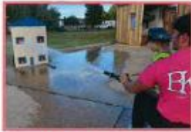
Use a fire hose