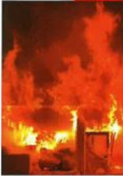
Live fire demonstrations